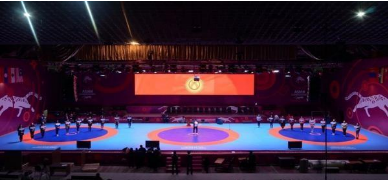
This is the view of the competition venue